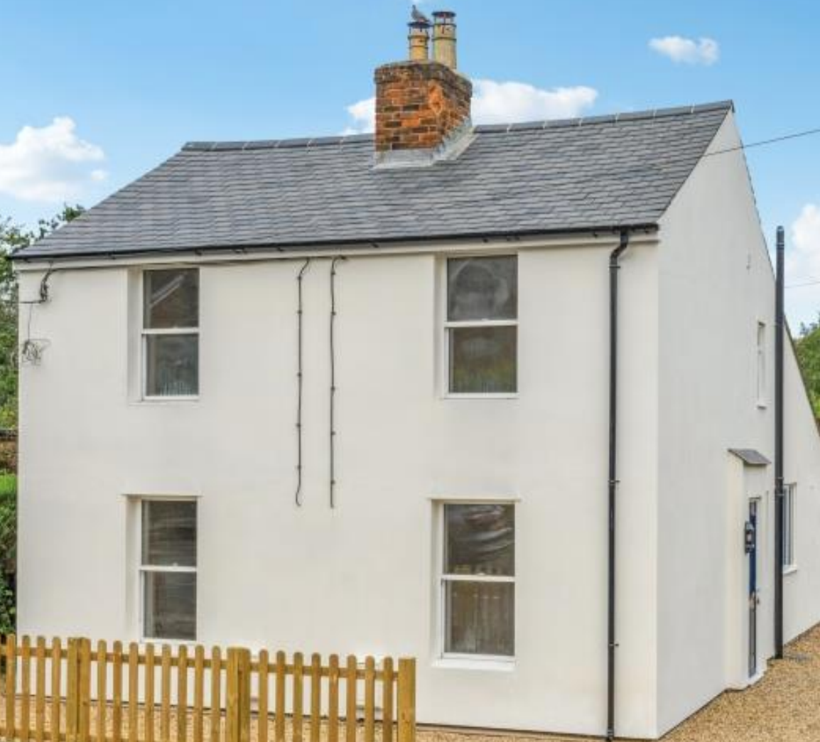
2, Arthur's Cottages, Stag Lane, Great Kingshill, Buckinghamshire, HP15 6EW